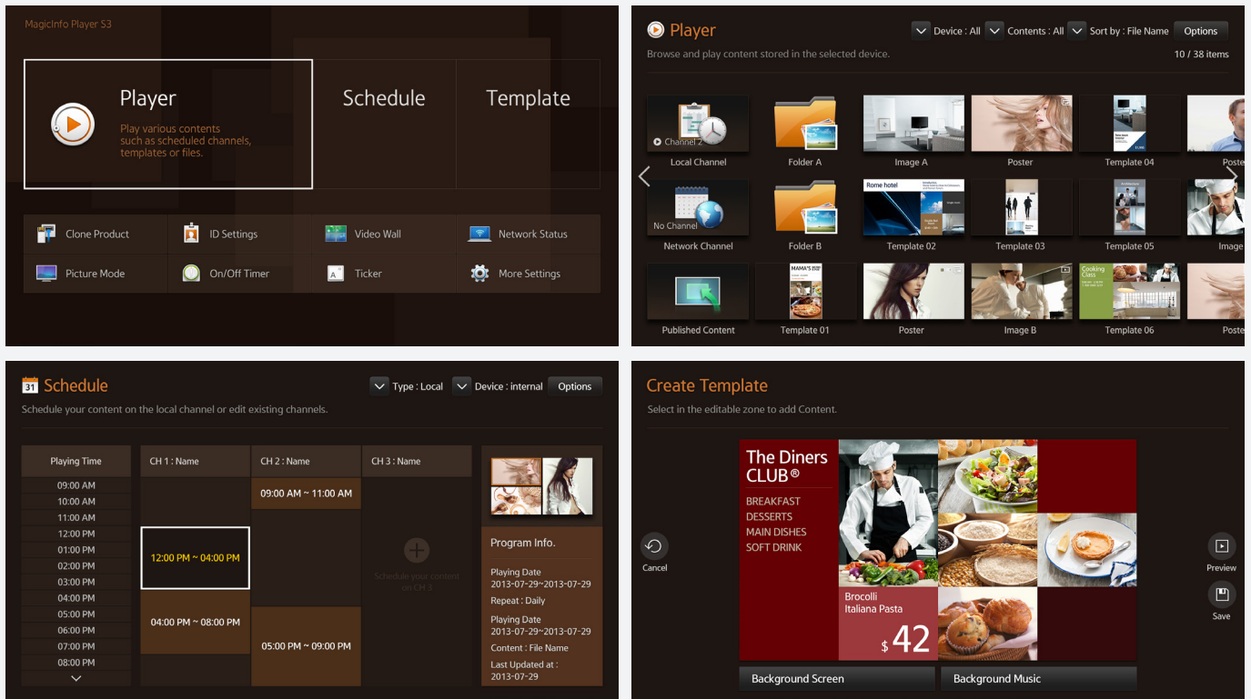
Figure 3. Various functionalities of MagicInfo S3