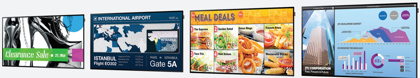
Figure 1. Extensive usage in virtually any business environment